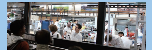
Field trip to Delft University of Technology