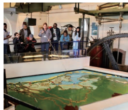
International Internship in Netherlands

JDS Fellows have opportunities to participate in overseas seminars with at least one of our faculty members so that they learn how to undertake research and survey for data collection. They can also expand their global leadership networks.