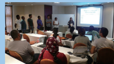
Presentation of JDS students in Okinawa