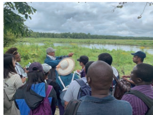
Field Trip in Hokkaido

JDS Fellows join field trips in Japan that are specially designed to respond to the development issues of Fellows' countries. In the past, JDS Fellows went to places where they could observe and examine issues that are related to waste treatment, recycling technology, forest conservation, protected area policies, rural development, urban planning, biodiversity and satoyama, traditional knowledge, tourism, environmental disaster prevention, public works, pollution, climate change, and energy problems, among many others.