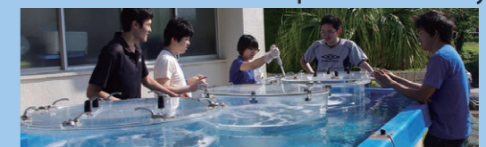
Shimoda Marine Research Center