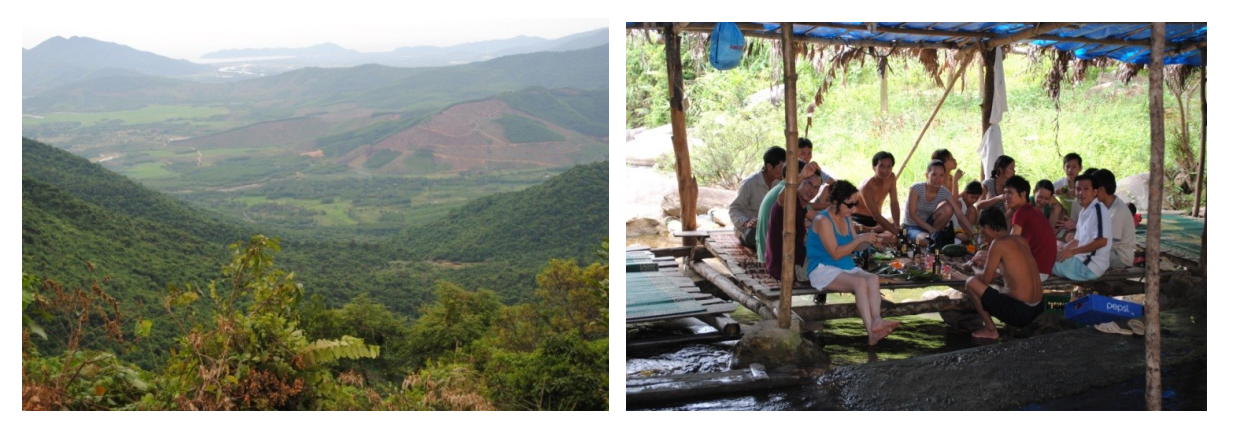
Fig. 3: Bach Ma National Park and the buffer zone

Bach Ma National Park has attempted various activities for income generation of the buffer zone people. One of the most successful attempts is simple resthouse management by the local people. Groups of local tourists visit the huts built on the rocky creek beds and enjoy cool weather and local food (Fig. 4). Contrary, the southern boudaries, the opposite side from the national park office where we could not visit this time, are more seriously affected by illegal logging, according to the interview to the national park staff.