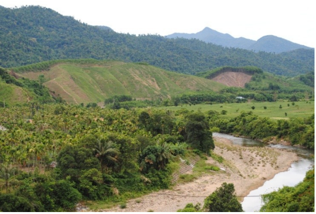
Fig. 2: Land use in Thuong Lo commune

In this village, natural forest was allocated for group of local people and planting forest was allocated for individual households. There are 7